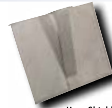
Heat Shield Baffle